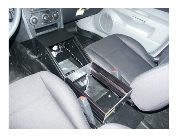
View of installed C-VS-0812-CHGR